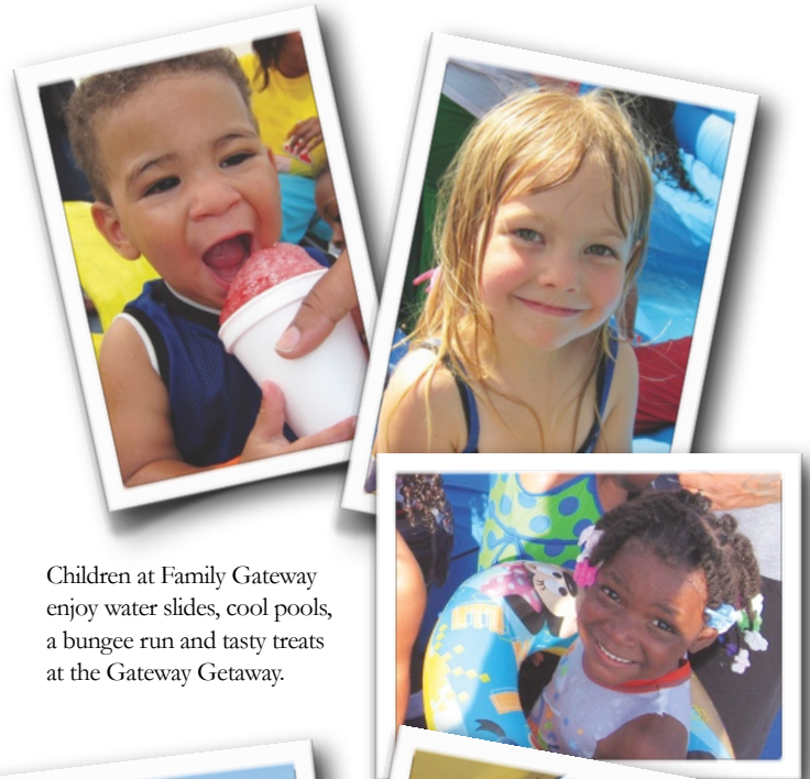
Children at Family Gateway enjoy water slides, cool pools, a bungee run and tasty treats at the Gateway Getaway.