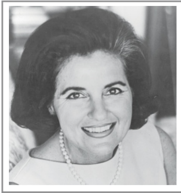
Family Gateway founder, Annette G. Strauss.

The Gateway Guild unites visionary members of the local community who seek to inspire others and better serve Dallas' homeless children and their families. Supporting the vision that Annette G. Strauss had almost 25 years ago, members demonstrate their commitment by investing in Family Gateway's present and future with a multi-year pledge.