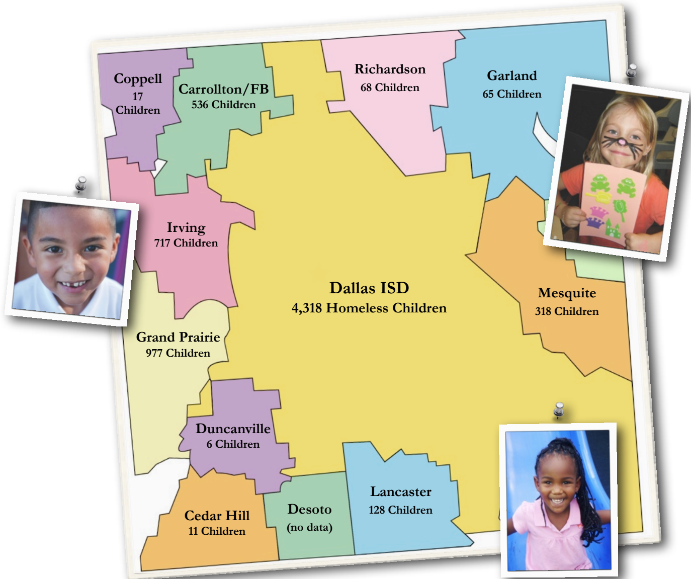
Dallas County School Districts with Number of Homeless Children

There are thousands of homeless children in Dallas alone. Behind this shocking statistic there are real children with nowhere to call home.